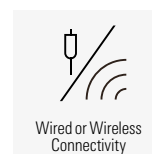
Wired or Wireless Connectivity