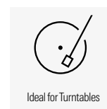
Ideal for Turntables